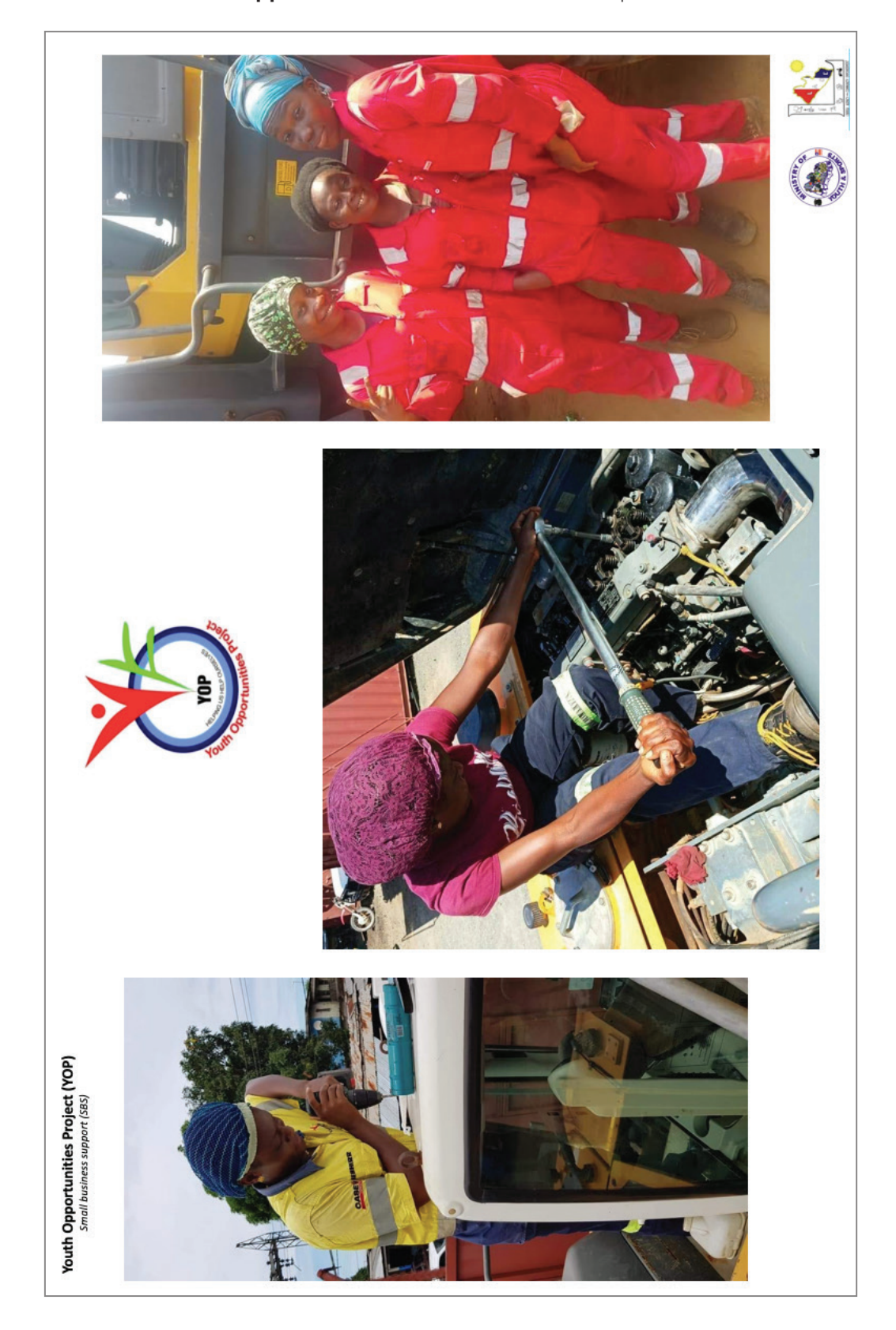
Appendix A: Women's sector choice poster